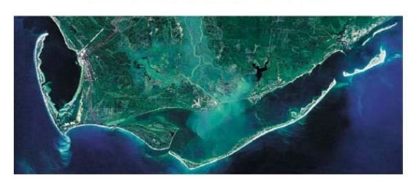
SEPTEMBER 24, 2019

APALACHICOLA BAY SYSTEM INITIATIVE FLORIDA STATE UNIVERSITY