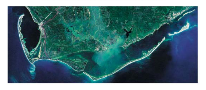
SEPTEMBER 24, 2019