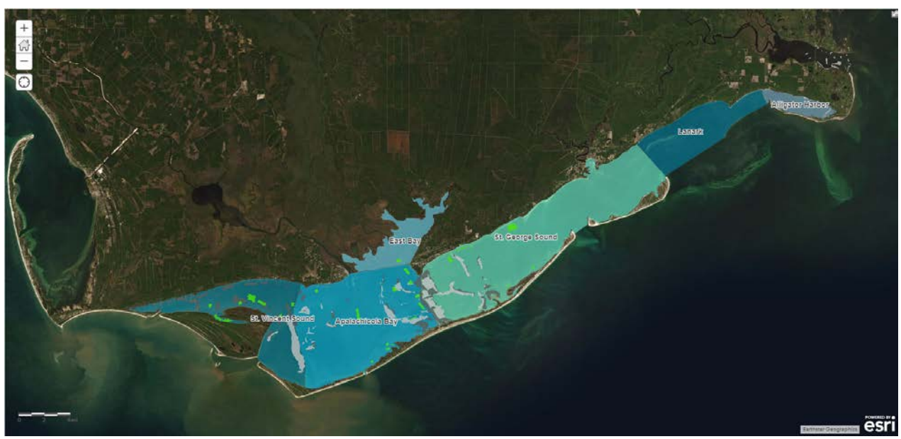
ABSI Project Area Map

1. Yellow boxes are groups of people. Blue arrows connecting yellow boxes indicate some or all of the people in one group may comprise the next group in time sequence