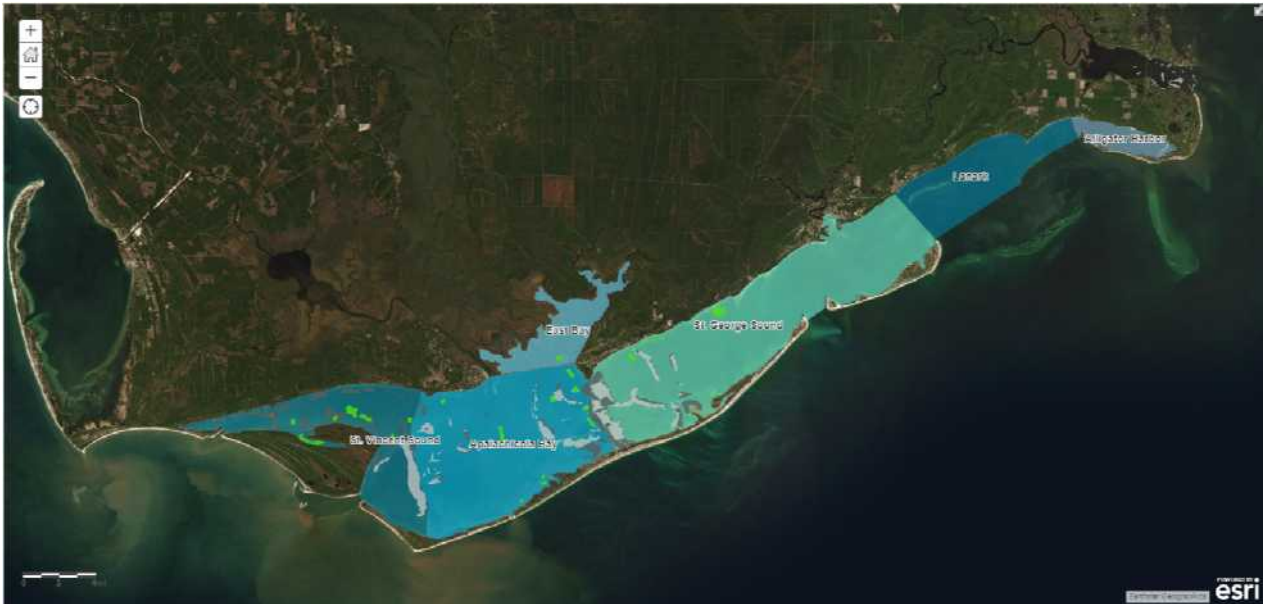
ABSI Project Area Map

1. Yellow boxes are groups of people. Blue arrows connecting yellow boxes indicate some or all of the people in one group may comprise the next group in time sequence