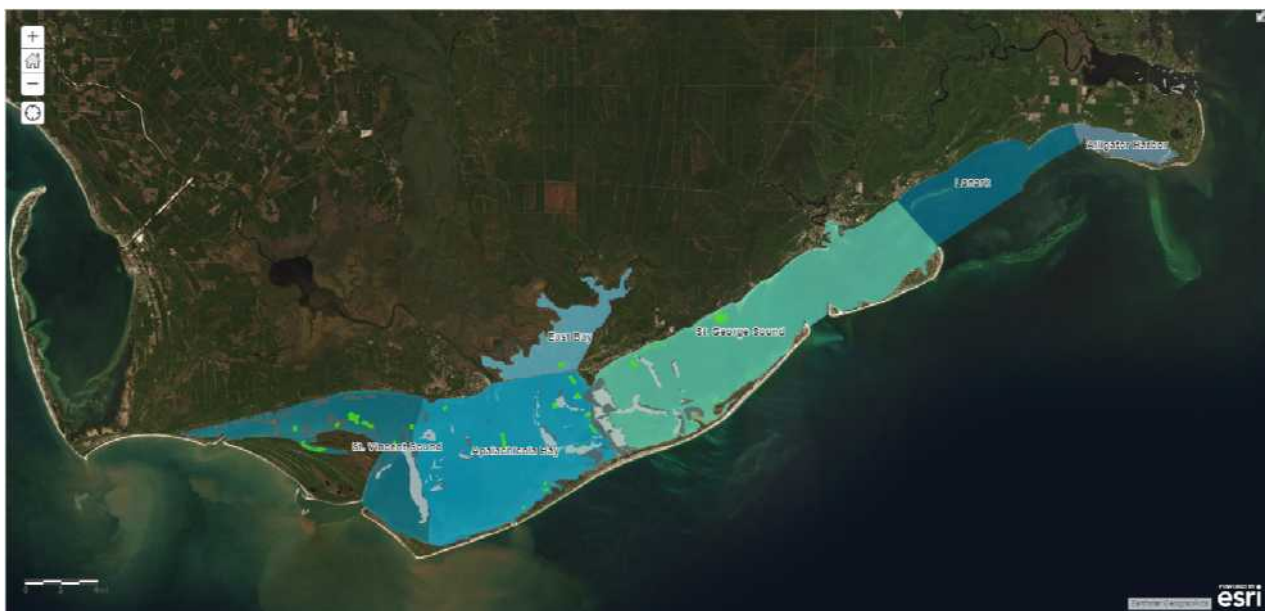
ABSI Project Area Map

Notes 1. Yellow boxes are groups of people. Blue arrows connecting yellow boxes indicate some or all of the people in one group may comprise the next group in time sequence