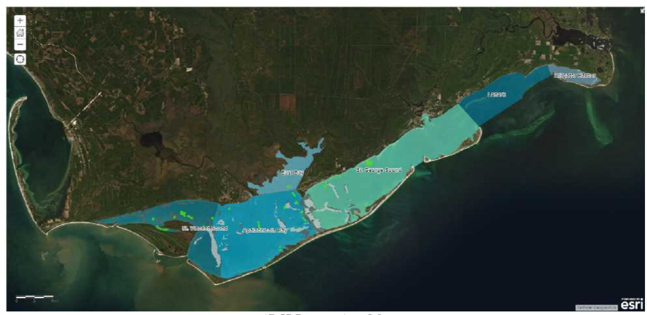
ABSI Project Area Map

1. Yellow boxes are groups of people. Blue arrows connecting yellow boxes indicate some or all of the people in one group may comprise the next group in time sequence