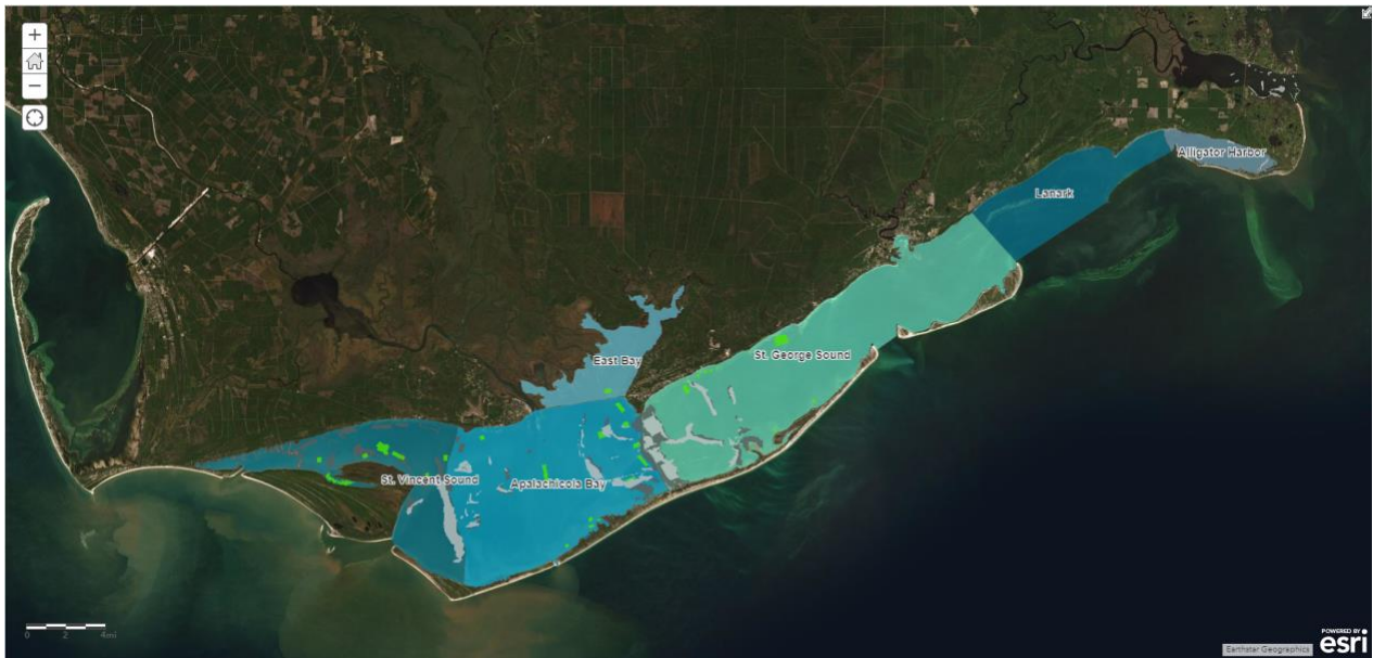
ABSI Project Area Map